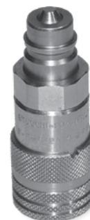
F. FIRG12A M. BIR12