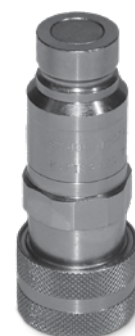
M. FIRG12A F. BIR12